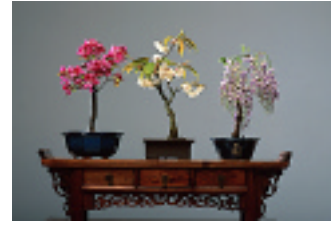
Wistaria , Prunus and Malus - Wistaria , Japanese peach and Malus bonsai trees