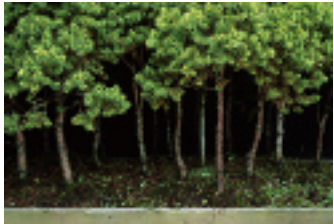
Picea glauca conica - Spruce bonsai forest trunks - Yose-ue style, 12 to 18 years old.