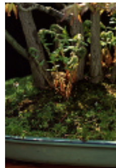
Acer palmatum - Japanese maple bonsai tree.