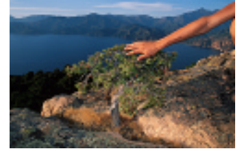
Meeting with a natural juniper bonsai tree above Porto' bay - Corsica