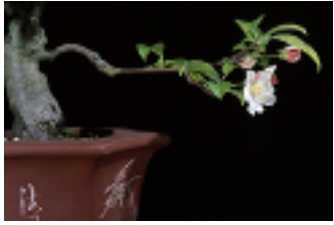
Malus cerasifera - Apple bonsai tree