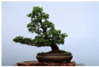
Pinus pentaphylla zuisho - Shakan style - 5 needles pine