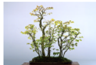
Carpinus laxiflora - Hornbeam bonsai tree - Yose-ue style, 15 to 60 years old