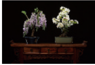
Wistaria floribunda and Malus cerasifera - Apple and wisteria bonsai trees