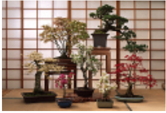
Malus, Ulmus, Acer, Pinus bonsai trees in front of a trellis.