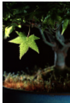
Acer palmatum - Japanese maple bonsai tree - Leaf