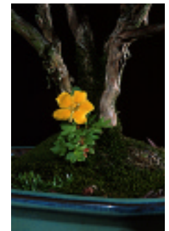
Potentilla fruticosa - Potentilla bonsai - Tachiki Style, 12 years old.