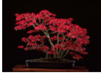
Acer palmatum deshojo - Maple bonsai tree - Kabudachi Style, 70 years old