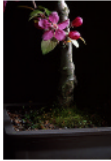
Malus cerasifera benikaïdo - Apple bonsai tree