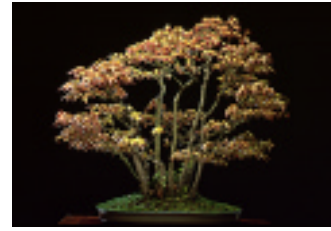
Acer palmatum - Japanese maple bonsai tree - Kabudachi Style, 70 years old