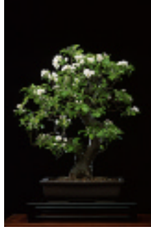
Malus himekokoh - Apple bonsai tree - Sokan Style, 70 years old.