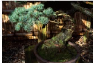
Pinus pentaphylla zuisho - Tachiki style - 5 needles pine