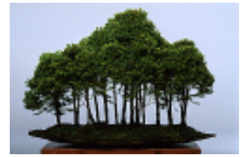
Picea glauca conica - Spruce bonsai forest