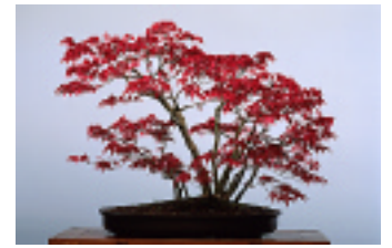
Acer palmatum deshojo - Maple bonsai tree - Kabudachi style, 70 years old.