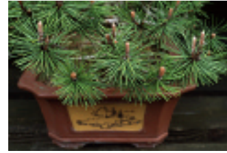
Pinus nigra - Austria's black pine - Nejikan style, 45 years old